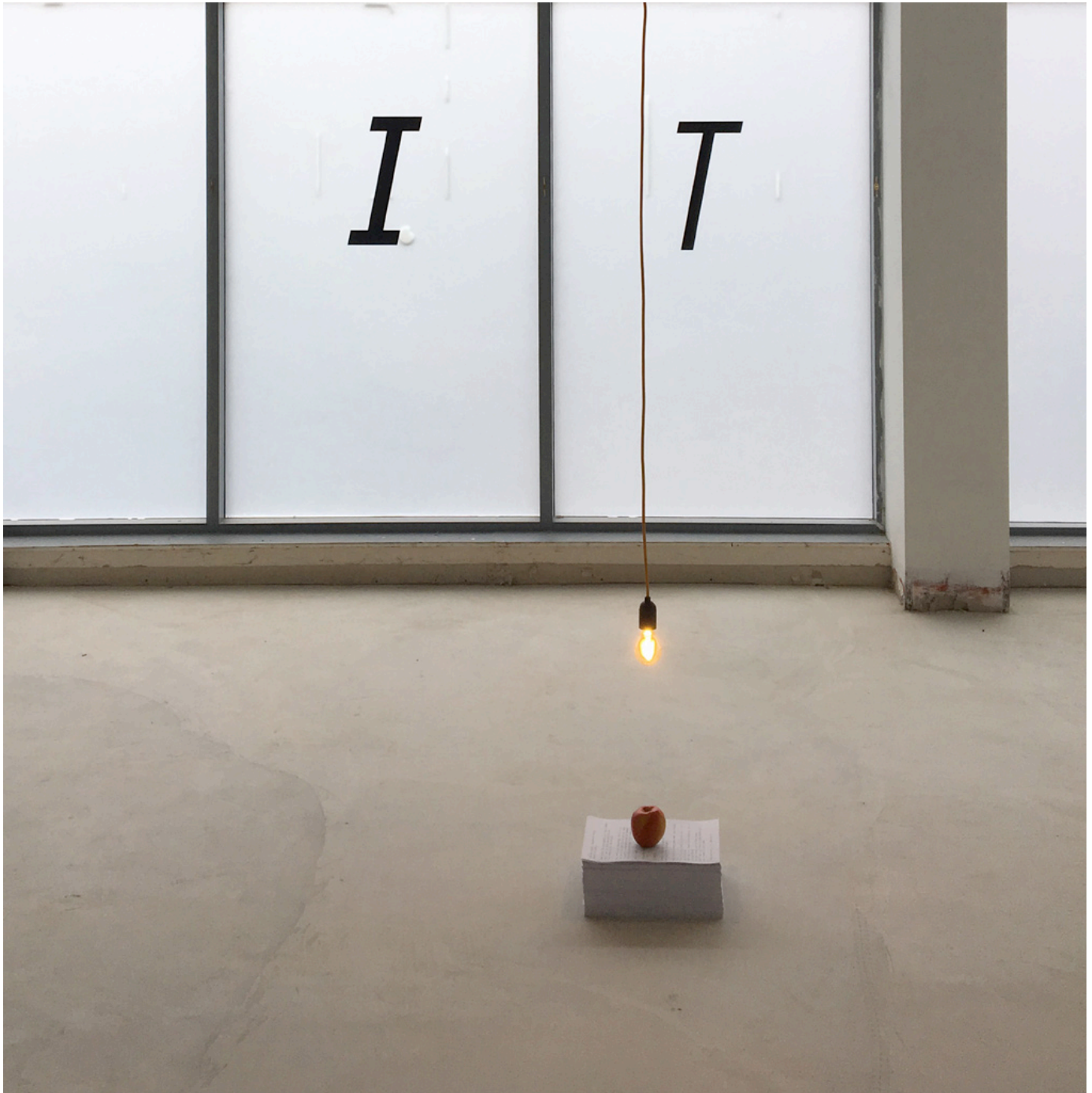
Kirsty Harris, (foreground) The Apple , 2016-19, mixed media, dimensions variable, (background) IT WORKED , 2016, vinyl, dimensions variable.