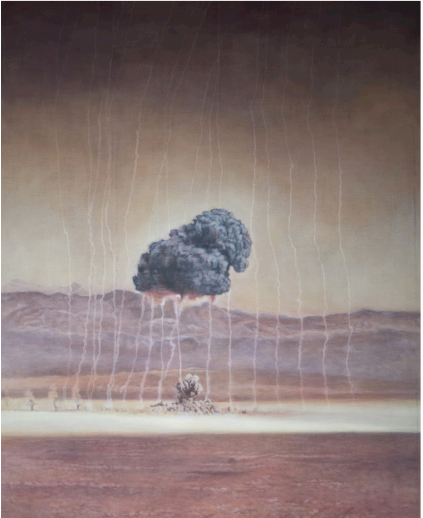
Kirsty Harris, Ranger Able, 2019, oil on unstretched linen, 80x63ins.