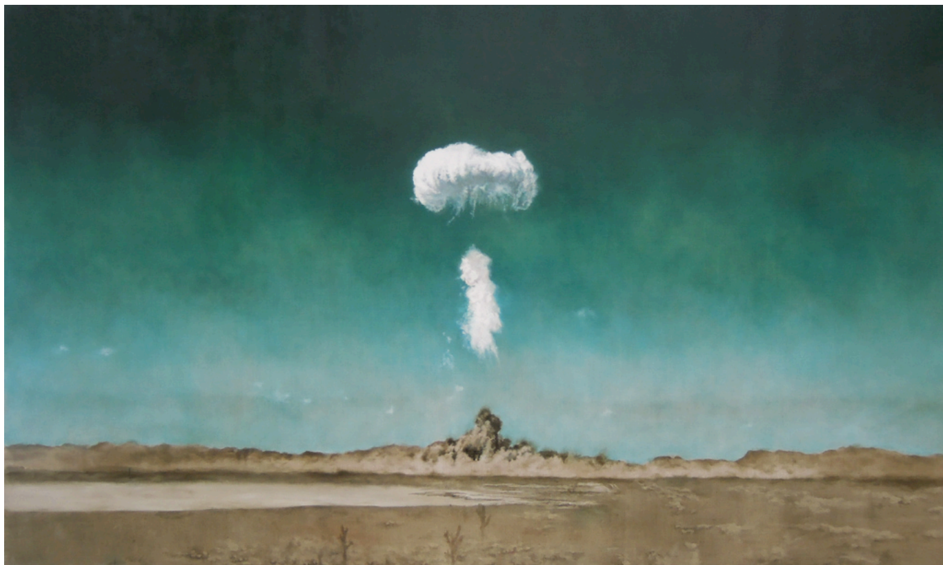
Kirsty Harris, Charlie, 2017, oil on unstretched linen, 69x112ins.